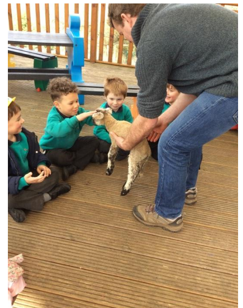
Thank you for all your support.